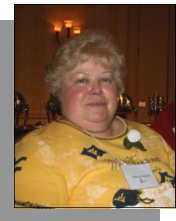
Parents of children with developmental disabilities